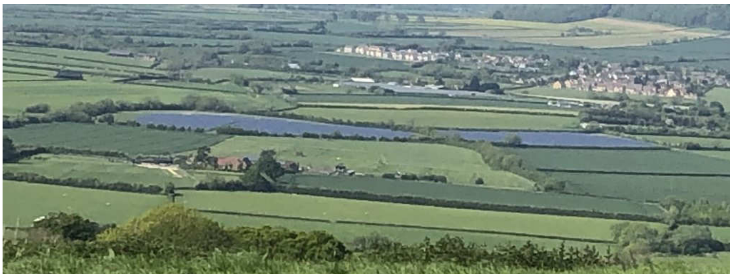
Above - Solar site near the village of Alderton receives comments that the arrays look like lakes.

Solar farms are often visible from some of the long distance and national trails such as the Severn Way and Cotswold Way, especially where footpaths are elevated along hilltops and the escarpment. Panels have a lower visual impact when they are a low reflectance type without reflective frames.