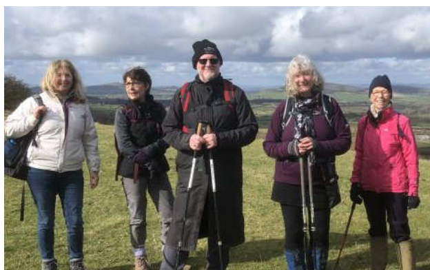
North Cotswold Ramblers at Stanton