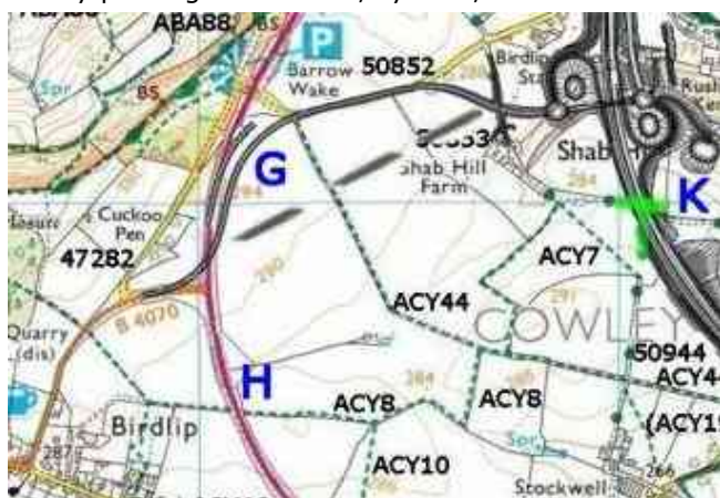
(Map Images OS and HE)

An alternative direct route has been proposed from Shab Hill junction to Birdlip (shown dashed at G) to keep the road, into Barrow Wake view point, clear for all day parking for walkers, cyclists, horseboxes etc.