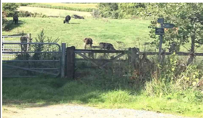
Sign: Public Bridleway No Motor Vehicles

In the last 10 years have you used this wooden side gate to reach the bridleway from the layby? The gate is now a fence and barbed wire. Our colleagues in the British Horse Society are seeking user evidence for it to be re-opened. Email grnews@gloucestershireramblers.org.uk