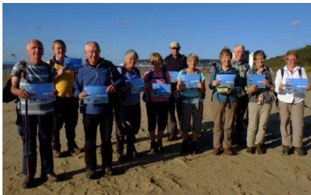
South Cots Members receiving their certificates.