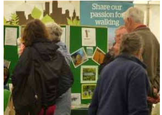
FoD at Speech House Forest Active Day

General Council (March 2014 Liverpool) is the place where ramblers from across the country get together to debate current topics. Motions are put forward by Members through their Groups and Areas. However time is set aside for workshops discussing ideas for the future. Politicians from various backgrounds spoke briefly about the benefits of walking and ramblers. It may not be surprising that every £1 spent on walking can save £7 on the NHS. We learned about the House of Commons walking & mountaineering club and the way MPs have enjoyed ramblers' walks. Also the usefulness of legacies in funding ramblers & special projects.