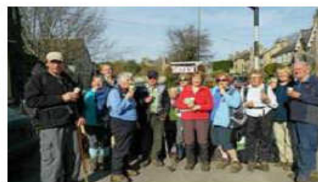
SCR in Box on the ice cream walk – doing what they do best

outsourcing of PROW work and the current situation with footpath work. At the last Committee meeting they reviewed 8 new reported obstructions as well as one new planning application for a new path near Wotton Under Edge.