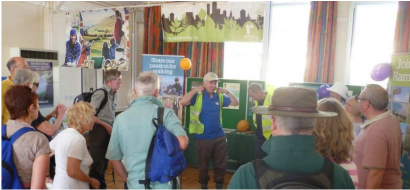
Some Events: Winchcombe Walking Festival