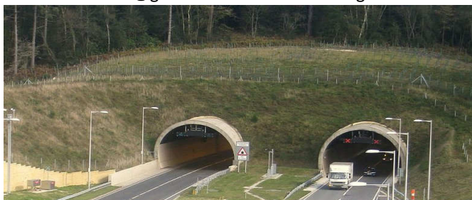
Photo: mouth of the curved tunnels at Hindhead