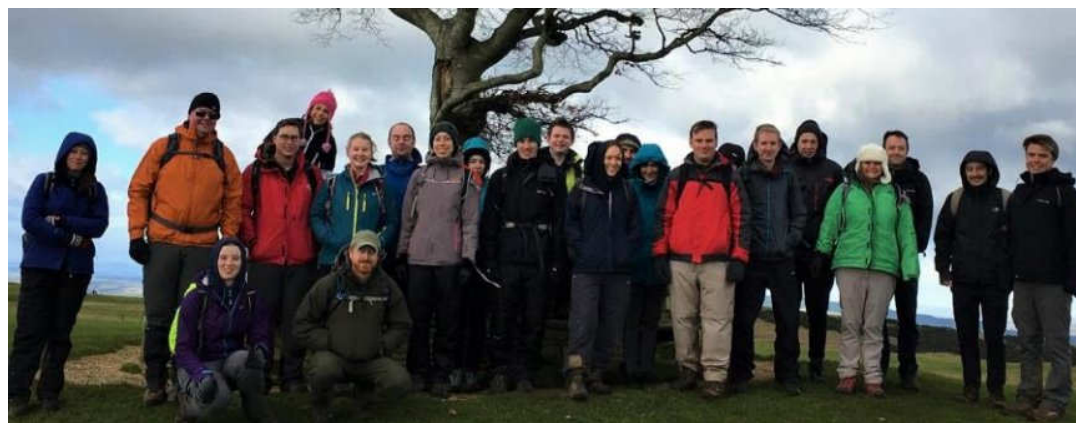
In May Members joined a National 20-30s event in Edinburgh. Young Ramblers are going places!