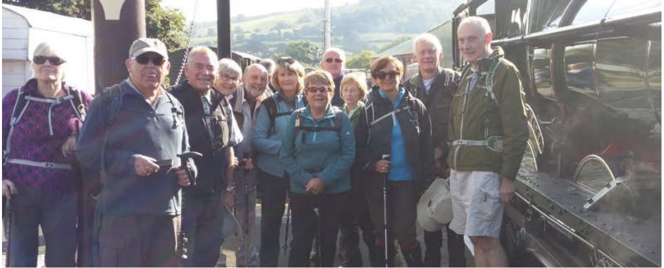
Cleeve members and guests at Cheltenham racecourse for a ride on the GWR Steam Railway and a walk back over Cleeve Hill.