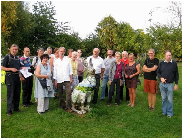
Why not sign up to ramblers.org.uk/walkabout ? There is still time to register how far you walk and apparently there are badges to be won! (Supported by the People's Postcode Lottery)