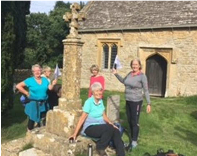
Above North Cotswold Group waving their flags at Farmcote Church as part of the Ramblers 9 day Walk About festival from 3 -11 September Below Cirencester Group have their flags too and 'met the artist' at an evening walk around the famous Hare Trail in Cirencester