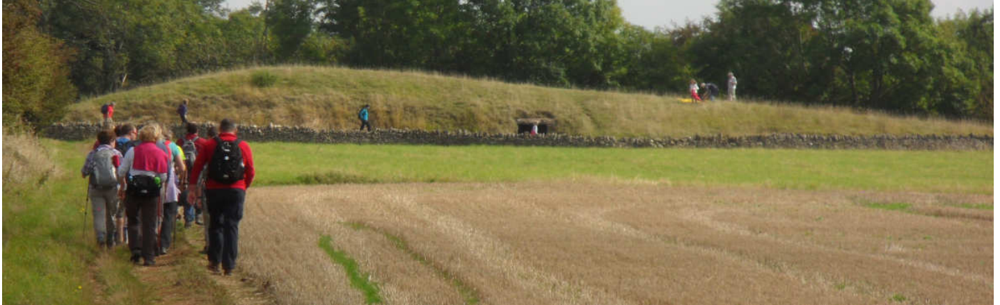
Cirencester Group at Belas Knap